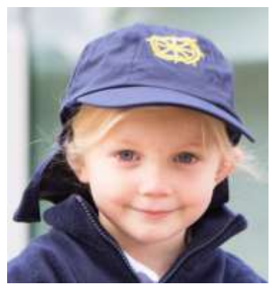
<u>Legionnaires hat and</u> <u>baseball cap- non-compulsory</u> - £6 One size

<u>Scarf – non-compulsory</u> - £10 One size