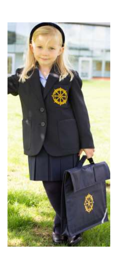
Blazer - compulsory - £55

Sizes from 22 to 34 inches (1 inch increments)