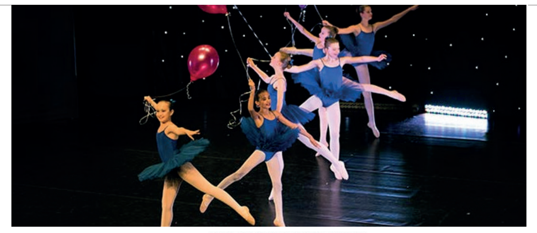
St Catherine's Bramley students in a dance show